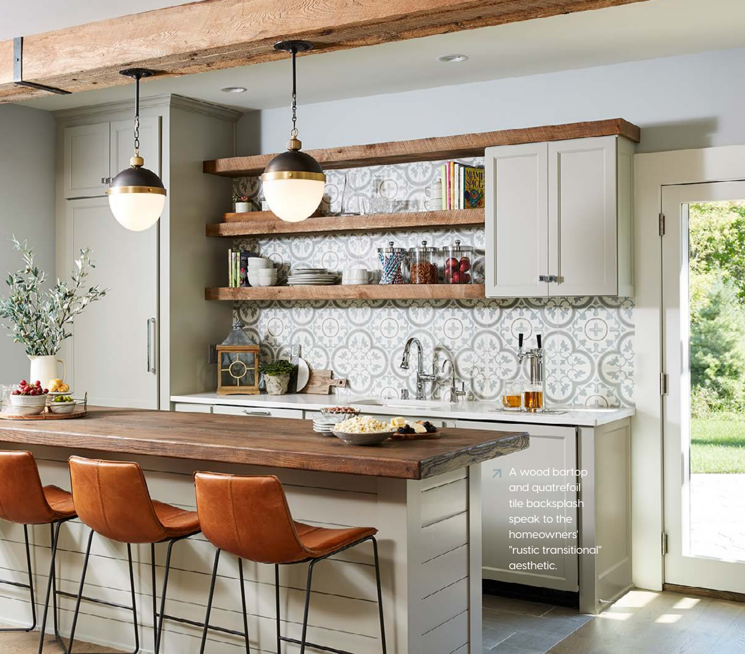
➤ A wood bartop and quatrefoil tile backsplash speak to the homeowners' "rustic transitional" aesthetic.